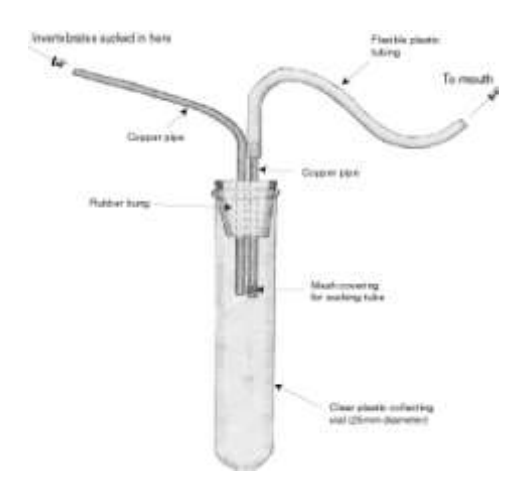
An apparatus used to collect insects from a beating tray called a 'Pooter' or an aspirator (above). A collector, beat sampling a small shrub with a sturdy stick and a beating tray (left).