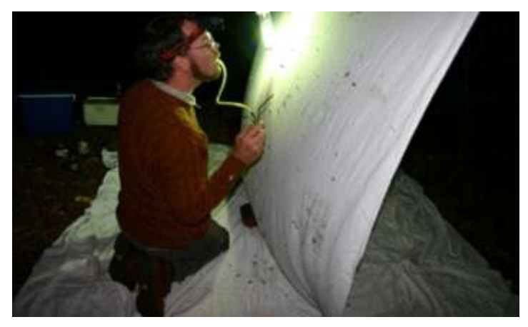
Researcher collecting insects during light trapping.

Light trapping operates on the principle that at night, insects of many groups are attracted to light.